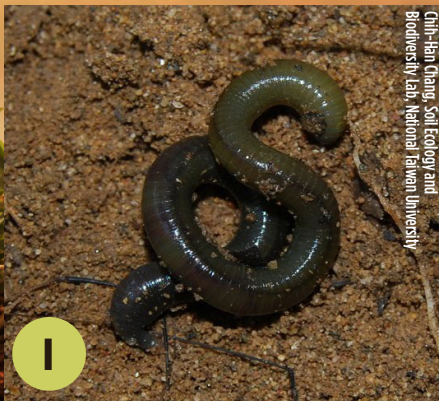
Cih-Han Chang, Soil Ecology and Biodiversity Lab, National Taiwan University

The European red composting worm ( Eisenia fetida ) is the most commonly used earthworm in vermicomposting systems (using worms to recycle food scraps and organic matter into compost). It is rarely found in natural habitats, preferring compost piles where it sometimes forms very dense populations. It is a small, reddish earthworm, usually no more than four inches long. When stretched during movement, it can appear striped with yellow, because it does not have reddish pigment at the junctions between its segments. For this reason, it is sometimes called the tiger worm.