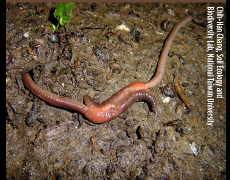
Gili-Han Chang, Soil Ecology and Biodiversity Lab, National Taiwan University

The octagonal-tail worm ( Dendrobaena octaedra ) is one of the most widespread earthworms in North America. Originating in mid-latitude regions of Europe, this is a leaf litter-dwelling (epigeic) species with a high tolerance to acidic soils and cold temperatures. It can be distinguished from other common earthworms by its deep purple coloring and small size (3/4 to 1 1/2 inches). In many places previously covered by glaciers, these earthworms continue to inch their way northward.