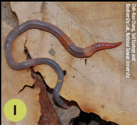
Cih-Han Chang, Soil Ecology and Biodiversity Lab, National Taiwan University

Native to East and Southeast Asia, jumping worms ( Amyntas agrestis , Amyntas tokioensis , and Metaphire hilgendorfi ) are spreading quickly into forests and horticultural landscapes throughout New York. These three species, which look very similar to each other, often co-invade. Their common name refers to their movement behavior. When disturbed, they thrash and often appear as if they are jumping. These earthworms are endo-epigeic; they live and feed within the organic layer (e.g., leaves, mulch, etc.) or within a few inches of the topsoil. As annual species, they hatch from small cocoons in the spring, grow to reproductive maturity in a few months, then die in the late fall, usually after the first hard freeze. Adult jumping worms have a milky-white to pink clitellum near their head, in contrast to their reddish-brown pigment. They are highly effective at modifying the topsoil structure into loose, granular castings.