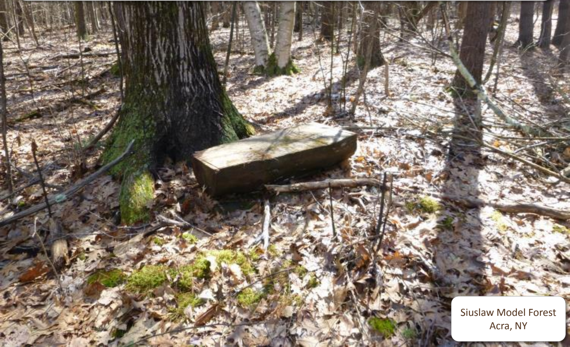
Siuslaw Model Forest Acra, NY

Going one step further, cutting a log in half will give you a flat spot to sit rather than a round one. A bench built this way will be lower to the ground, so it works well for children.