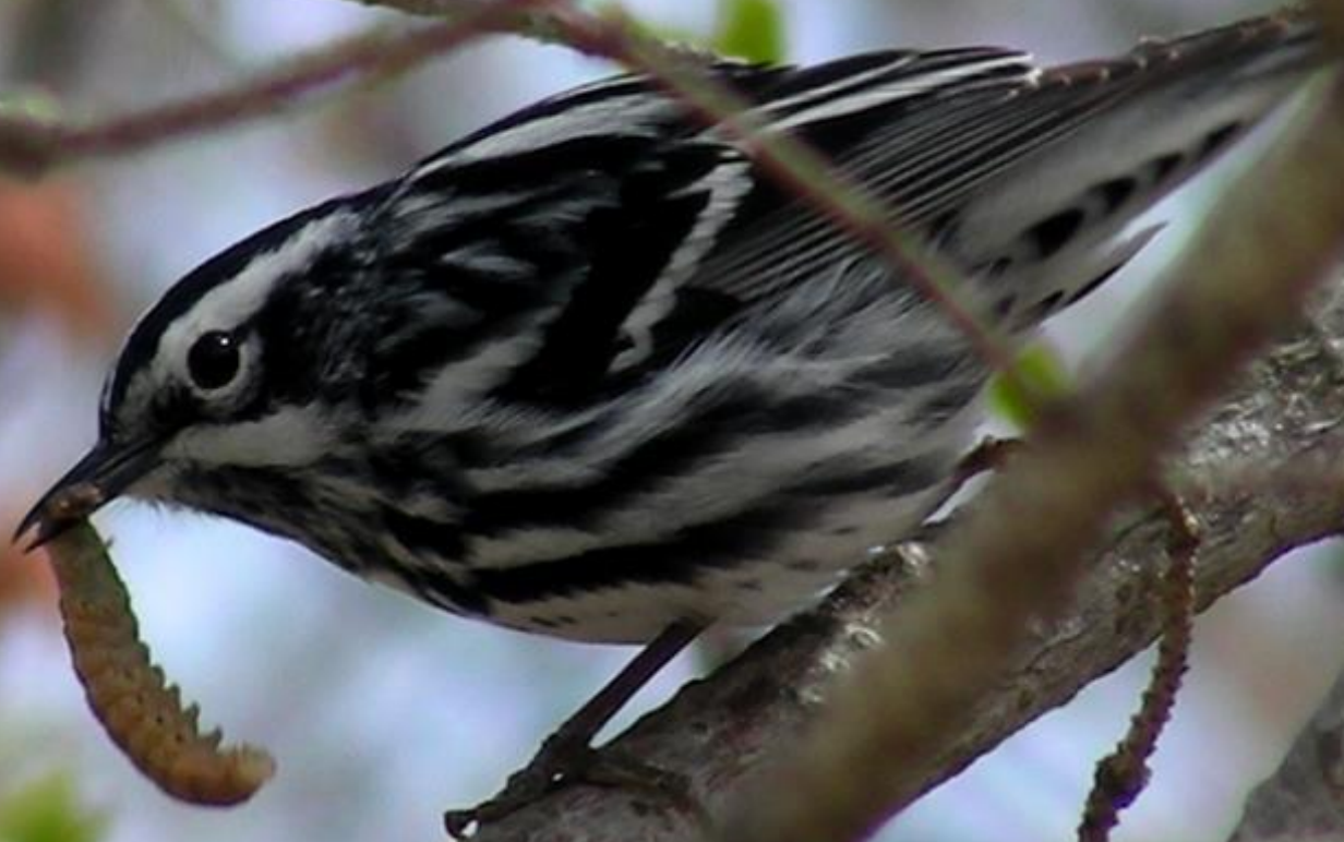
Black and White Warbler