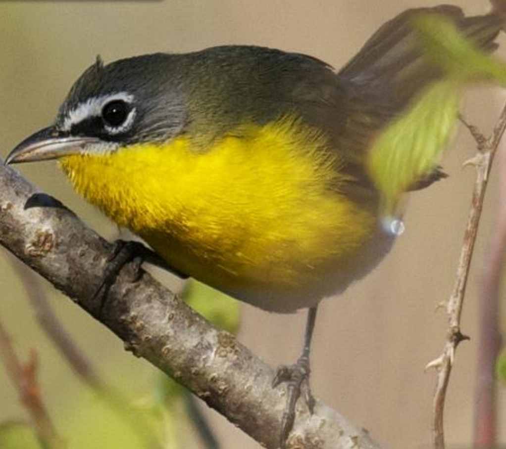
Yellow Breasted Chat